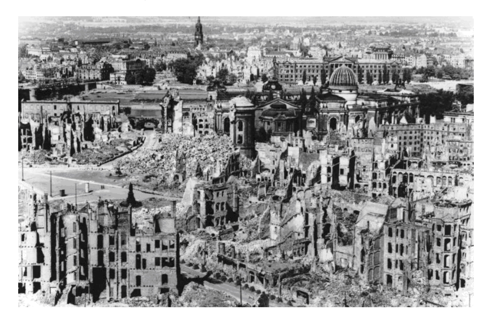
THE REAL HOLOCAUST Bombing of Dresden: An Act of Genocide